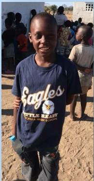
Children in Malawi wearing Eagles t-shirts!